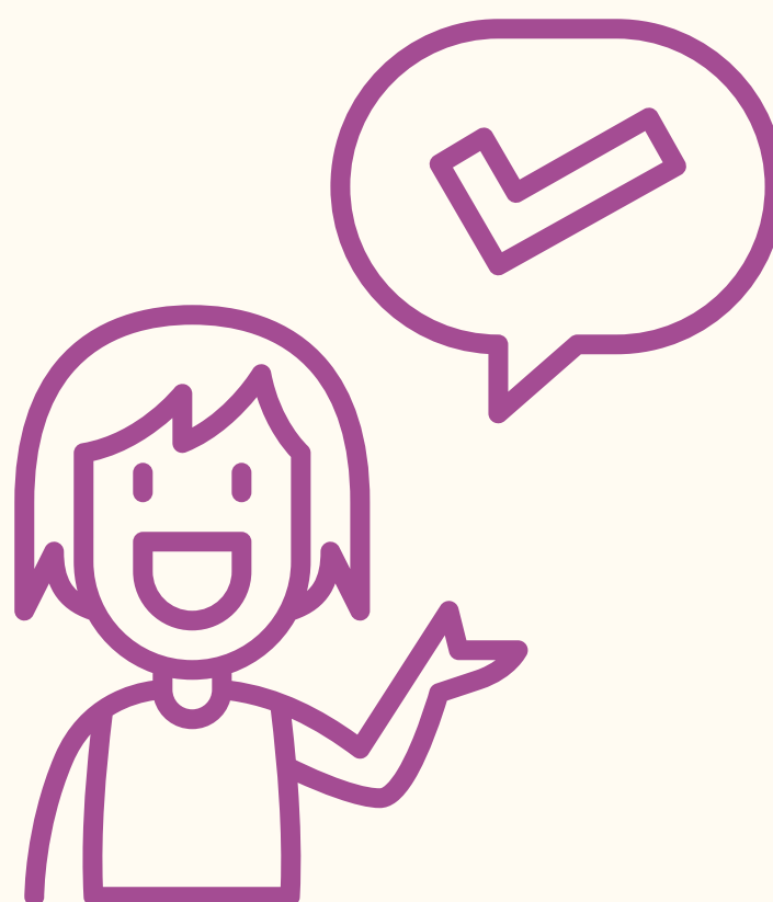
Trustworthiness and transparency